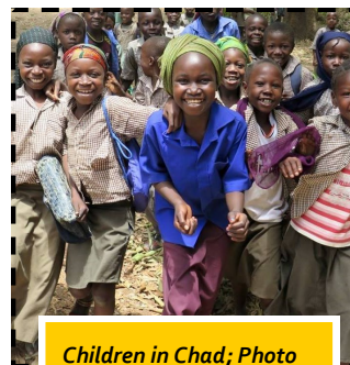
Children in Chad; Photo by Anna Beth Wivell

There are approximately 4000 languages without a Bible.