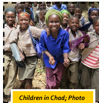
Children in Chad

Our work isn't done though. There are close to 4,000 languages without a Bible!